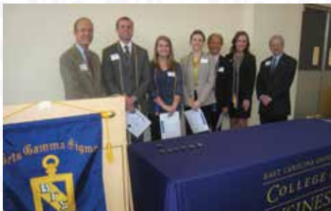
Spring 2013 Beta Gamma Sigma inductees from the master class.