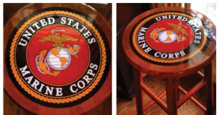
Examples of Kool Stools made by McKaughan.