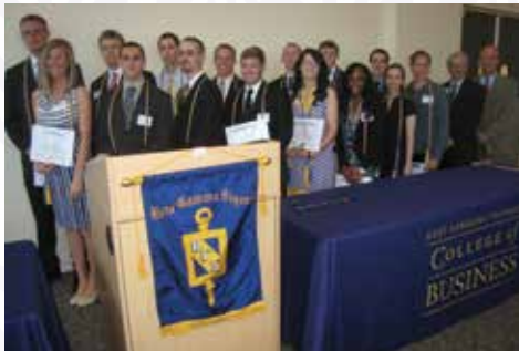
Spring 2013 Beta Gamma Sigma inductees from the junior class.