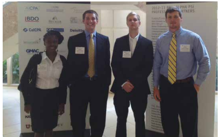
ECU BAPsi students attend the annual meeting in California.