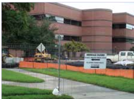
Sidewalks are closed as part of campus construction.

If you’ve seen East Carolina’s campus lately, you’ve probably noticed a lot of construction.