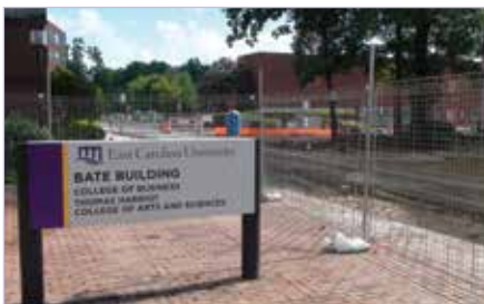
Construction in front of the Bate Building.