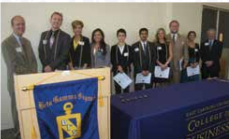
Spring 2013 Beta Gamma Sigma inductees from the senior class.