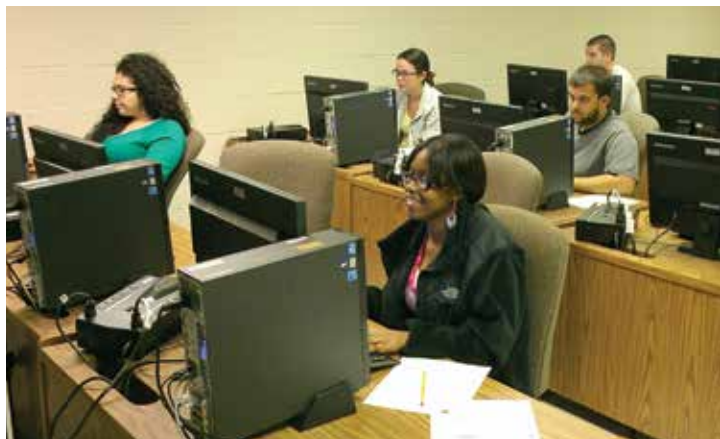
MSA students take the CPA Exam Field Test in April.

He added that hosting the Field Tests would not be possible without technical assistance from the College of Business Office of Technology, Information & Operations as well as proctoring support from graduate assistants.