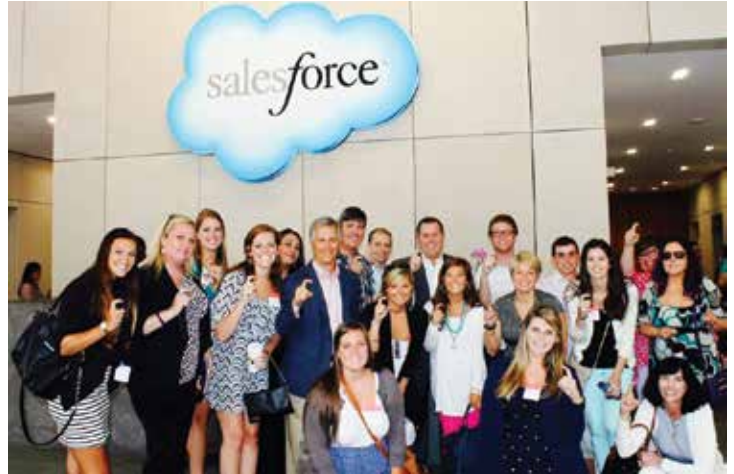
Students visit Salesforce.com in Silicon Valley.