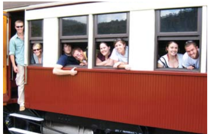
Students ride a train from the tropical rainforest back to Cairns, a city in Far North Queensland, Australia