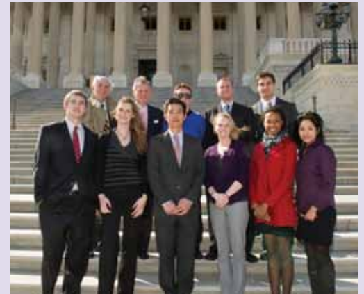
College of Business students take a picture with U.S. Sen. Burr during their visit Washington, D.C.