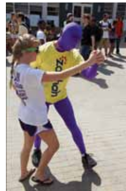
A man in purple Lycra helped to publicize the social media site, zaahah.com.