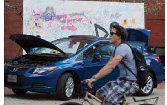
The student campaign for Honda included a wall where students could post their own messages.

"The students completed all of the functions of a real marketing agency, including research, strategy development, implementation, and post-campaign research/reporting, in 12 weeks, with sign-off from the client at each stage," Ashley said. "The timeline was ambitious, and we are all learned as we went along, but the students rose to the challenge. Our teams may not have won the national contest in the end, but they certainly did an impressive job."