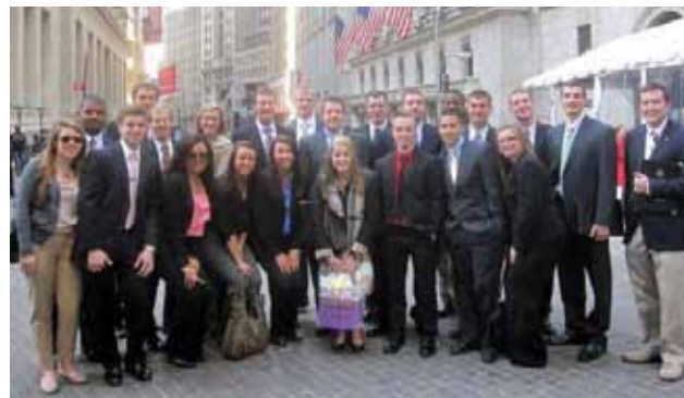
Members of ECU's Financial Management Association visit New York City during an April field trip.

The Financial Management Association is a student organization open to all majors. Its mission is to broaden the common interests between academicians and practitioners, provide opportunities for professional interaction between academicians, practitioners, and students, promote the development and understanding of basic and applied research and of sound financial practices, and to enhance the quality of education in finance.