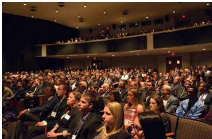
More than 1,000 students participate in the college's first-ever Business Leadership Conference.