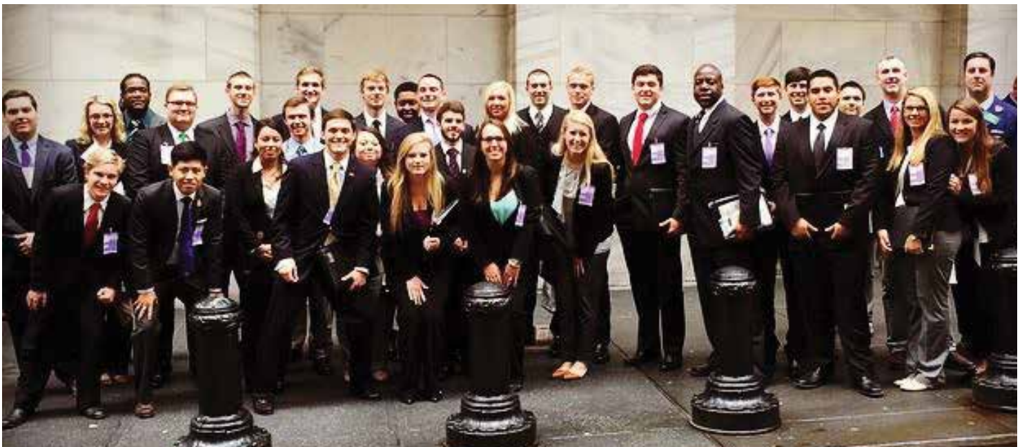
Members of ECU's Financial Management Association visit the New York Stock Exchange during a spring field trip.