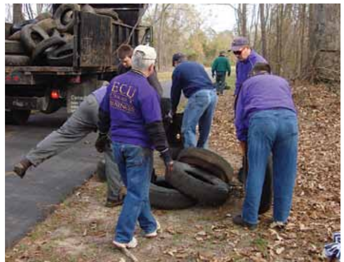
Volunteers found many tires along the greenway.