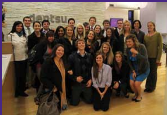
Marketing students visit Dentsu in New York City