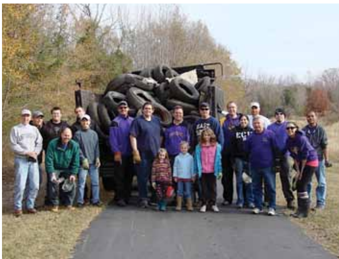
More than 15 College of Business volunteers helped clean the Green Mill Run Greenway on Dec. 10.

The City of Greenville helped the effort by providing an extra worker and a dump truck. In addition to faculty and staff, College of Business students were also allowed to participate and use the hours toward their service learning portfolio requirement.