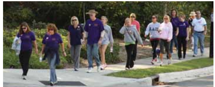
MBA students from ECU participate in the CROP Hunger Walk.

CROP Walks are community-based events to raise money for local hunger-fighting agencies as well as international relief and development efforts. Twenty-five percent of the proceeds from the Greenville walk will stay local, supporting the Campus Kitchen at ECU and the Food Bank of Central and Eastern North Carolina. The remaining 75 percent will be donated to the Church World Service organization, which distributes money to smaller organizations such as local food banks and soup kitchens.