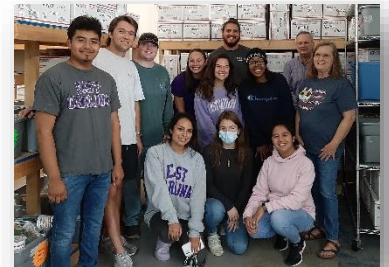
2022 NC Packs

BAPsi members volunteered for NCPacks4Patriots this year. NCPacks4Patriots provides needed supplies to U.S. Troops serving at remote locations overseas. Accounting students helped by counting inventory and preparing boxes of supplies for shipment.